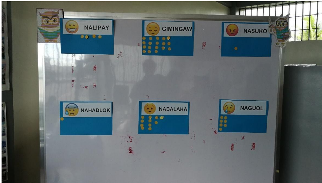
Board where they have to stick a small yellow circle to show their emotions. The board is being used by all participants of the FGD.