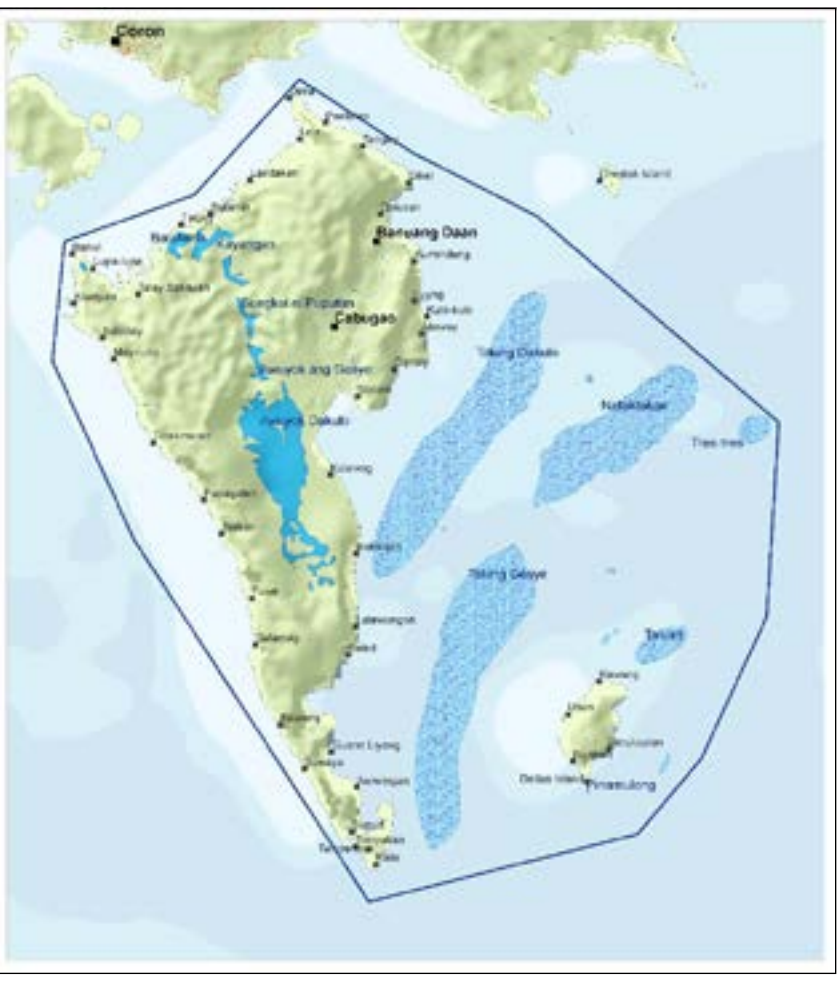
Map 1. Coron Island also known as "Batu" the line shows the extents of the ancestral waters while the dark blocks show the coral reefs that are managed by the Tagbanwa community.

Though Bàto extends to over 7,000 hectares, it is covered by mostly limestone cliffs, forestland and the awuyuk or lalaguna (interior lakes